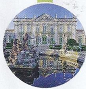
Queluz National Palace

As you may imagine from this, the course is compact. You have to be straight but the terrain does not gobble balls. Good use is made of the land. For example, the 14th is a 288-yard dogleg with a stream to cross and steep rise to a green tucked