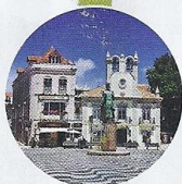
Cascais town centre

T he British have much to thank the Portuguese for. In particular to Catherine of Braganza, a Portuguese princess who married Charles II and who took with her to England the Portuguese aristocracy's custom of afternoon tea. Catherine's dowry was free trade for England with the Portuguese colonies, 500,000 pounds of gold and a box of tea.