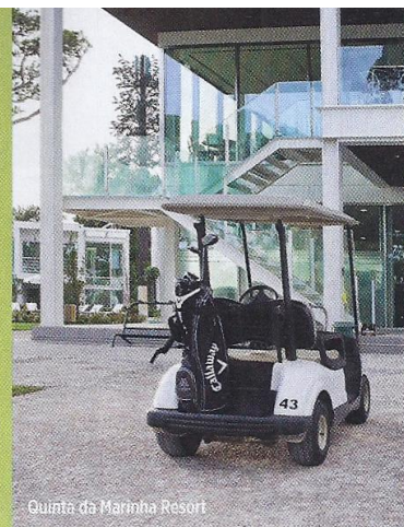
Quinta da Marinha Resort

Oitavos Dunes is another enjoyable course, beautiful and open. It is sometimes described as a links but, although on sandy soil by the coast, it is not a true links. There are some wide fairways to aim at and also some tight holes. My favourite hole was the exhilarating 160-yard 14th, which played up to the green over a chasm which runs diagonally from left to right. ■